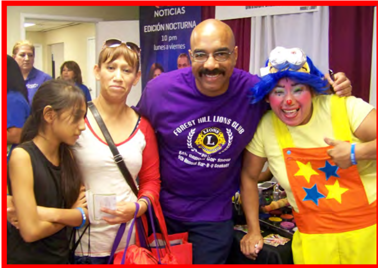
Mayor Gerald Joubert clowns around at Wellness Fair.