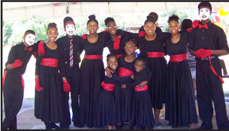
Selah Dance Ministry performed at the Family Fun Day at Griggs Park on Saturday, August 1. Water slides, horseback riding and hotdogs were among the favorites of the more than 240 kids who attended.