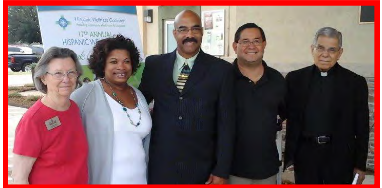
Dignitaries gather to open doors to Wellness event.