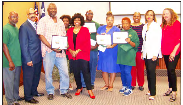
City Council and Parks, Recreation and Clean City Commissioners congratulate winner.

At the City Council Meeting on April 16, the Parks, Recreation and Clean City Commission along with the City Council recognized four Yards of the Month (pictured). The owner of the home at 3516 Alhambra was on hand to receive a certificate and a gift card.