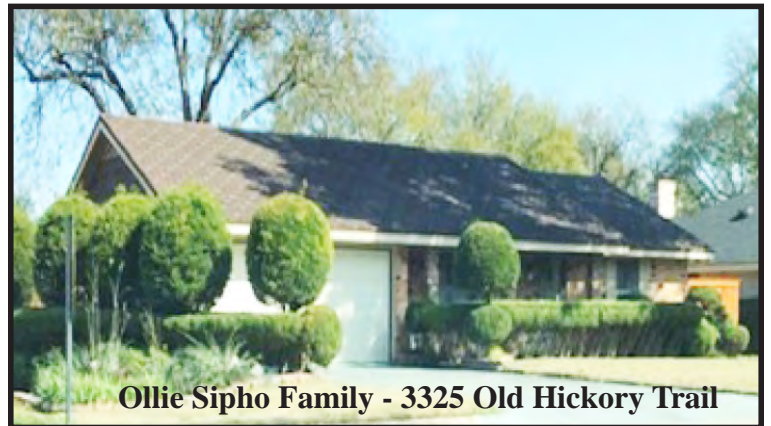
Ollie Sipho Family - 3325 Old Hickory Trail