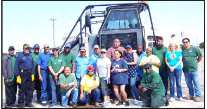
Public Works personnel, members of the City Council and Parks, Recreation & Clean City Commission plus volunteers at Cleanup Day.

Residents are encouraged to adopt a spot to keep clean in their own neighborhood and place an emphasis on making Forest Hill a better place to live.